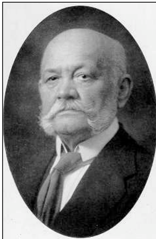
Figure 1. Franz Ritter von Soxhlet (1848-1926).